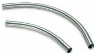
Stainless steel tube bends

Tubes have lower friction - and faster and smoother transportation - than hoses and should be used for all fixed installations. The total transport path, the vertical distance, the number of bends in the line, the diameter, whether steel tubing should be used, vacuum hoses or a combination of tubes and hoses, type of connections between the tubes – these are all factors to be taken into account when selecting a tubing system.