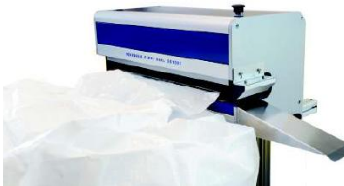
Welding of big bag spout. Automatic sealer with welding function. Includes suspension frame and with all necessary electronics.