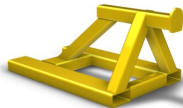
Fork lift yoke for collecting bags. Available for 1, 2, or 3 single loop bags. For collecting more than one bag, loop stretching is necessary.