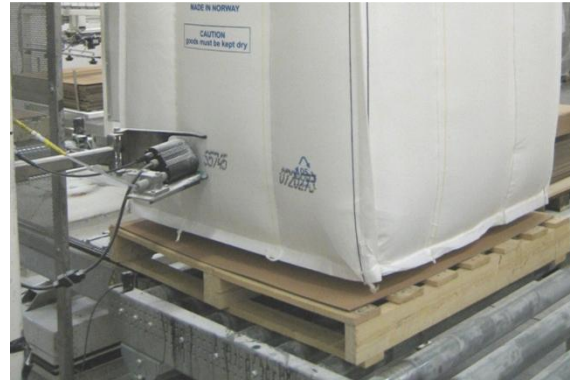
Marking of big bags with a printer, e.g. batch no, weight etc.