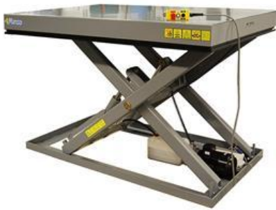
Lifting table for ergonomic pick-up of big bags.