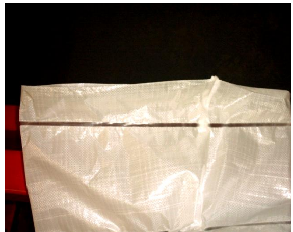
Result: Sealed spout, no material leakage.